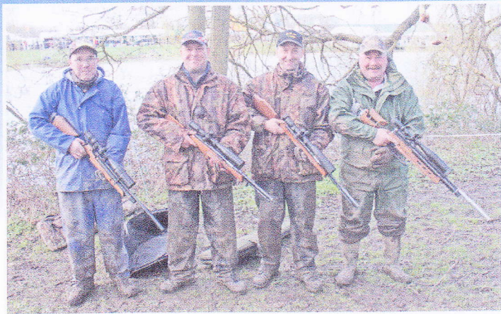
Above: The mud grubbers.