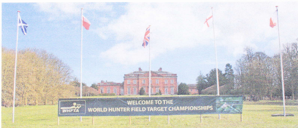
Left: Don't believe the flags.