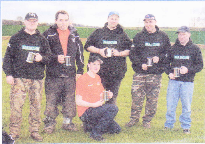
Above: Team England took the squad honour.